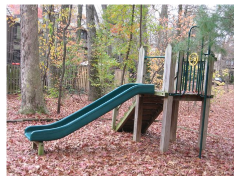
Wood chips were spread in areas surrounding the Farsta/Scandia playground by Cardinal.