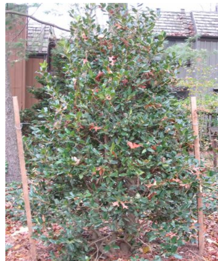
Landscape plantings were replaced on North Shore and Scandia by Meadows Farms to maintain the common areas' appearance.

Reseeding was done and topsoil was added to the lawn between Park Glen and Scandia, which was damaged by tree removal in September.