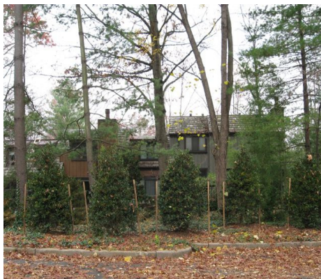
Five Hollies and one Redbud Tree were planted at the end of Farsta by Meadows Farms.

Two large Oaks infected with Borers were treated by Twin Oaks Tree Care.