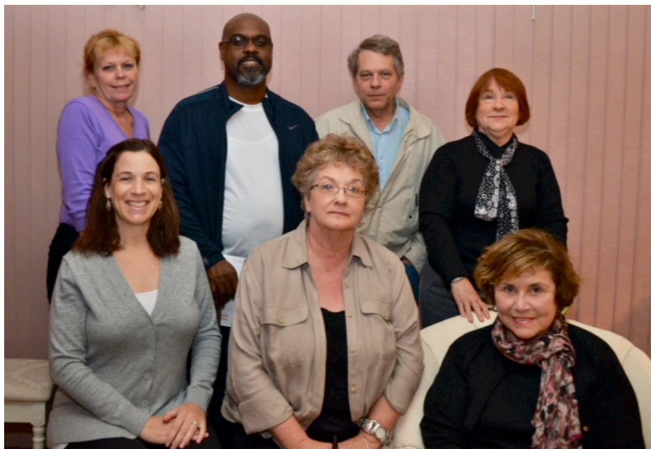
Meet your Board of Directors – Summer 2013